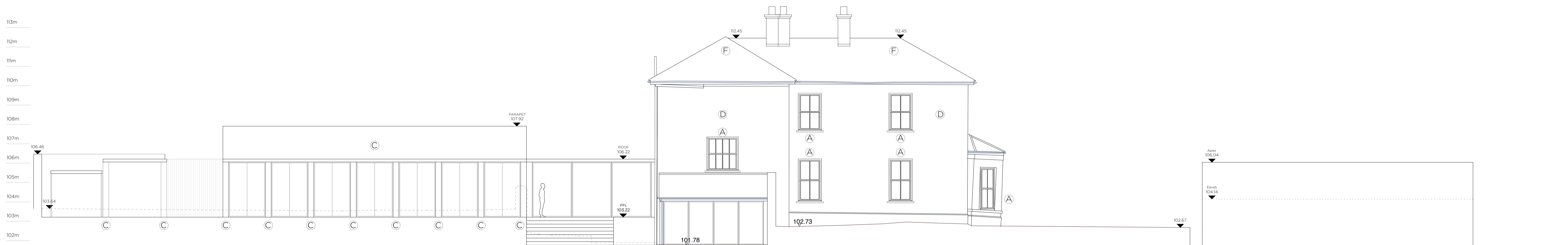
WEST ELEVATION _ PROPOSED