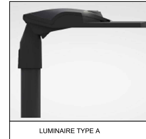
LUMINAIRE TYPE A

LIGHTING CALCULATIONS RESULTS Eav = 14.6 LUX Emin = 1.8 LUX Emin/ Eav = 0.13 LUX