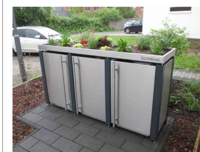
PRECEDENT IMAGE OF PROPOSED BIN STORE ENCLOSURE