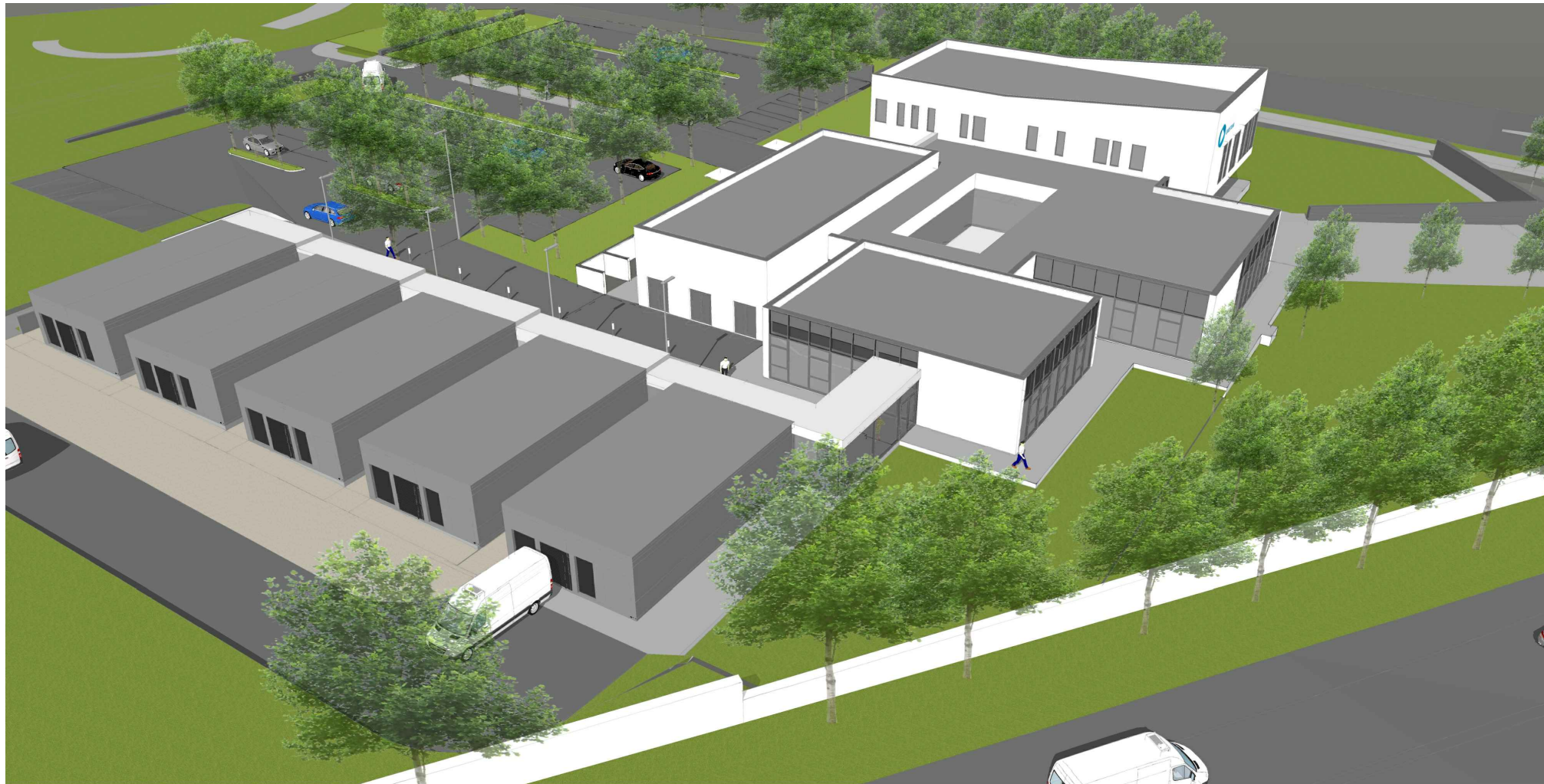
Proposed Birds Eye South West