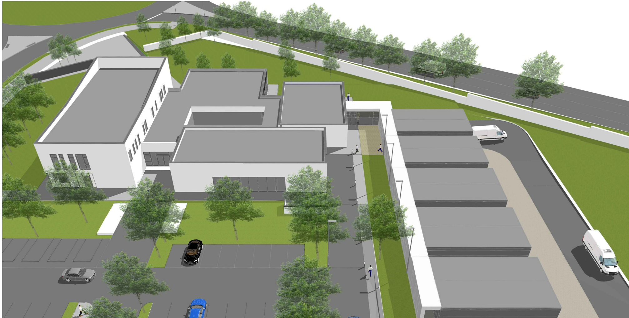
Proposed Birds Eye North