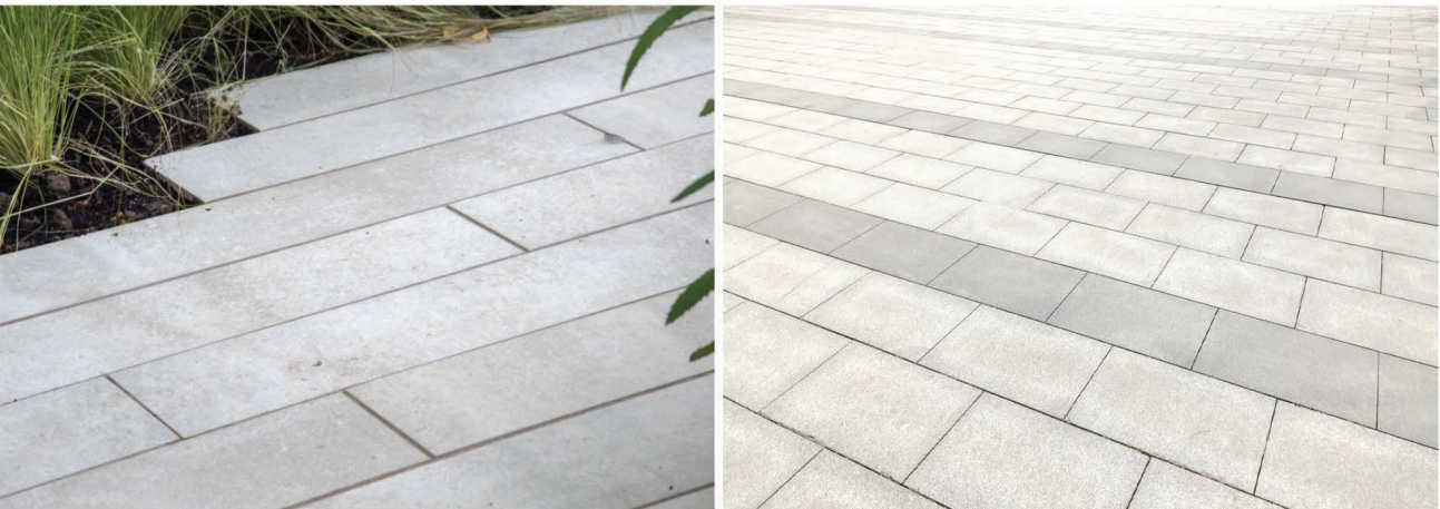
GRANITE NATURAL STONE SURFACING