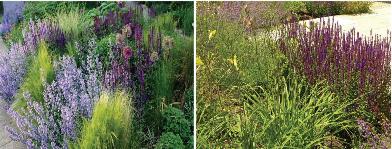
RAIN GARDEN SOFT LANDSCAPING