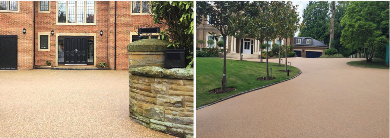
BOUND GRAVEL SURFACING