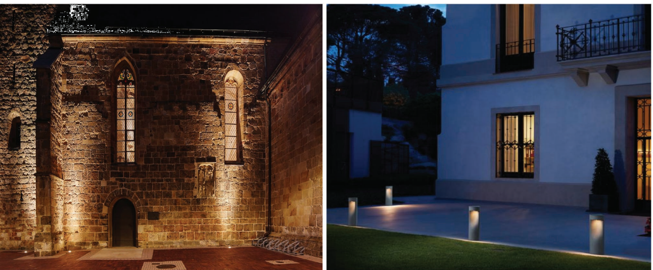
LOW LEVEL BOLLARD AND GROUND BURIED LIGHTING