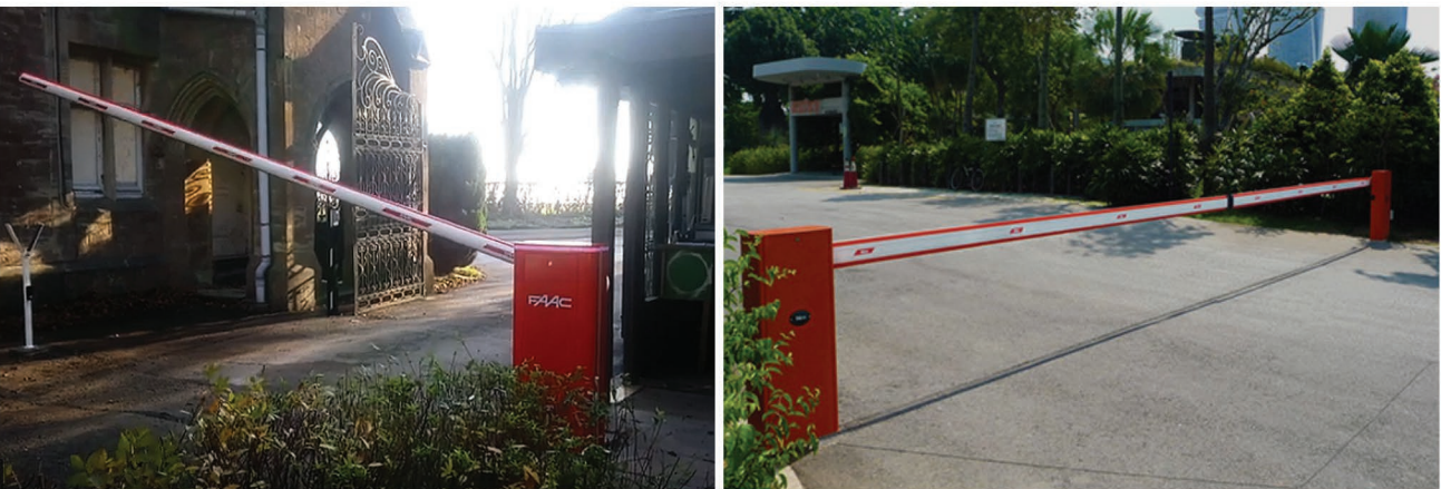
AUTOMATED BARRIER SYSTEM