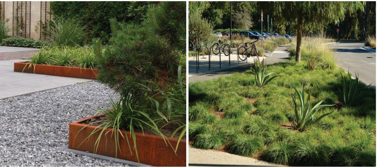
STEEL EDGINGS BETWEEN DRIVEWAY SURFACING AND SOFT LANDSCAPE