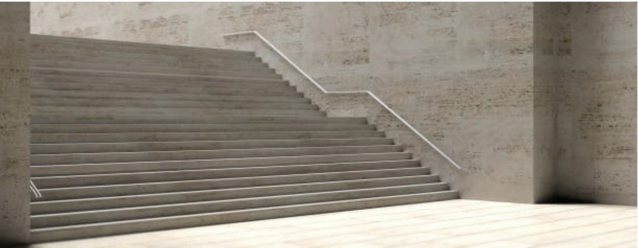
GRANITE NATURAL STONE STEPS