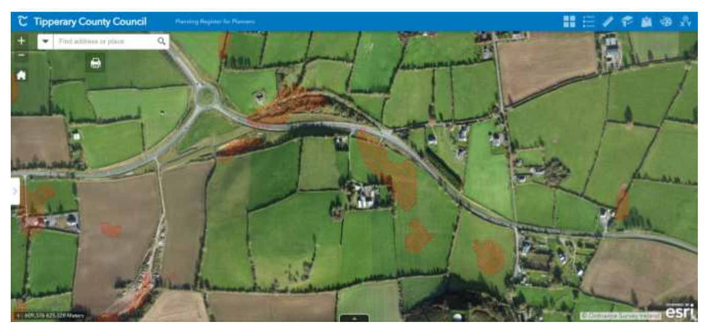
Figure 4 Areas identified at risk of pluvial flooding (hatched in red)

system which will continue to operate. I am satisfied that the proposal will not be at risk of flooding and will not increase flood risk off site.