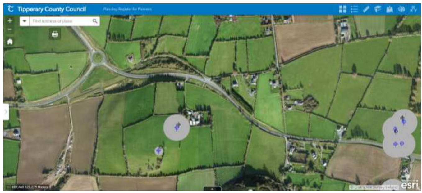
Figure 3 Zone of Archaeological Potential (ZAP)