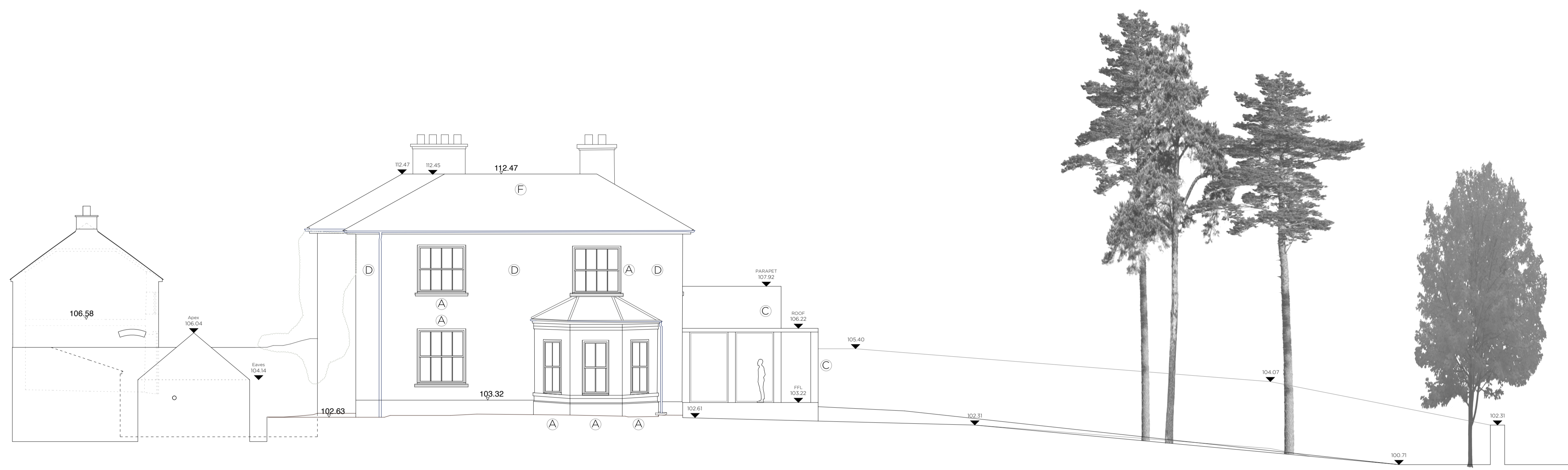
SOUTH ELEVATION _ PROPOSED

113m 112m 111m 110m 109m 108m 107m 106m 105m 104m 103m 102m 101m