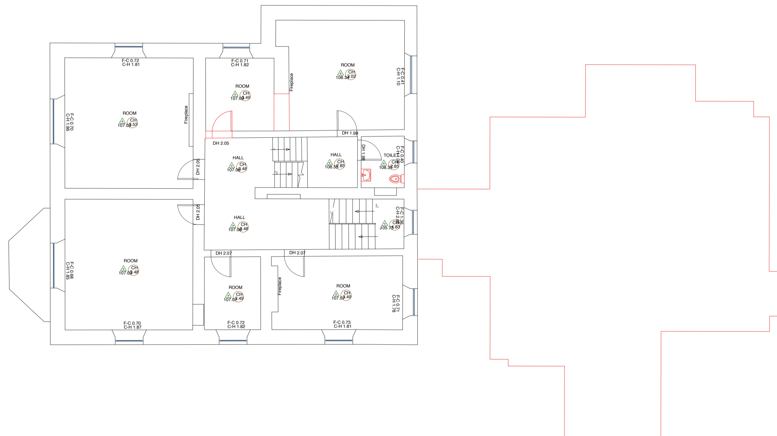
FIRST FLOOR PLAN _ DOWNTAKINGS

RED LINE denotes components and structures to be removed.