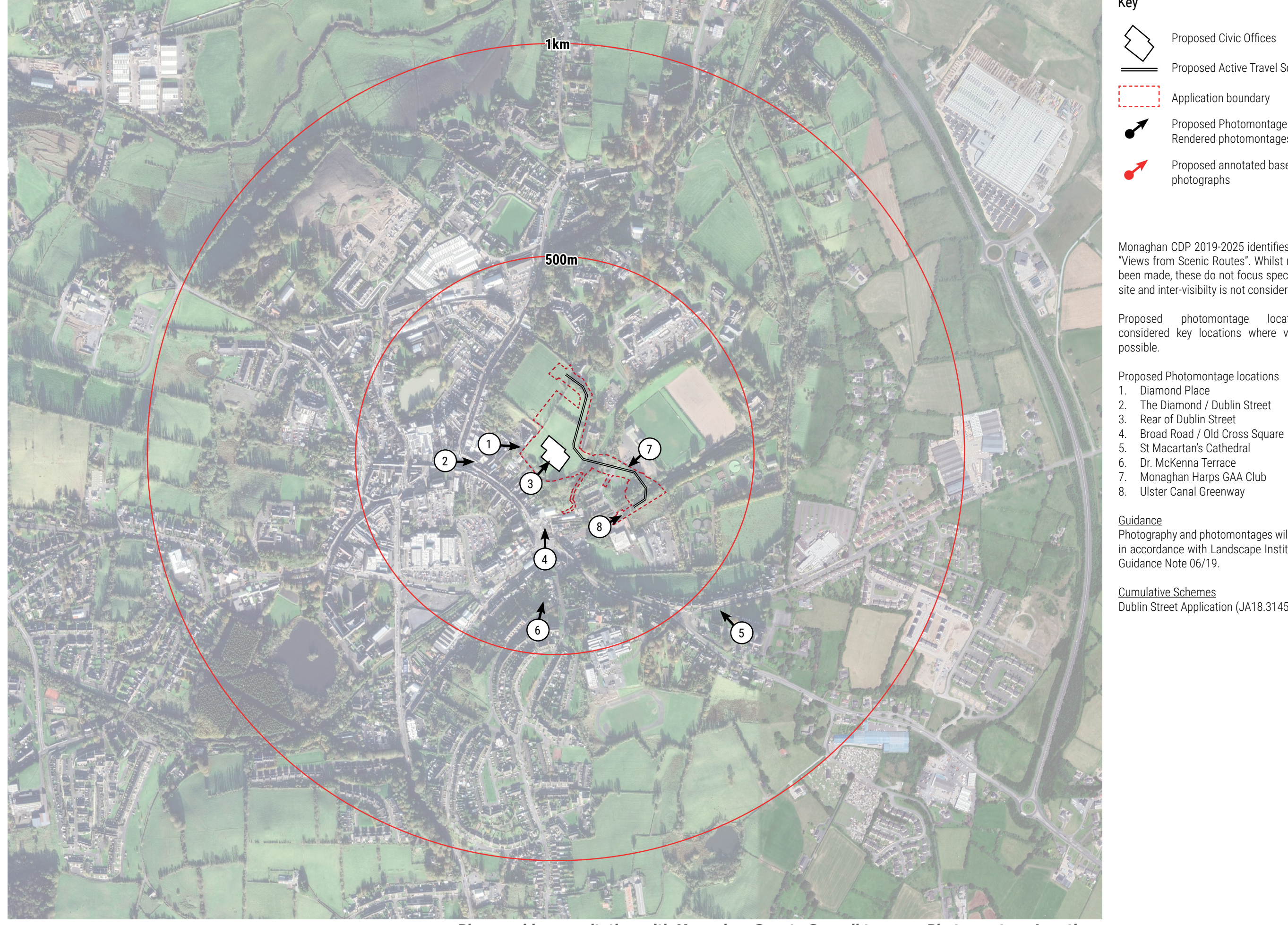
Plan used in consultation with Monaghan County Council to agree Photomontage Locations

A total of 8 viewpoints were identified as requiring Type 3 visuals, as shown in the Viewpoint Location Plan opposite.