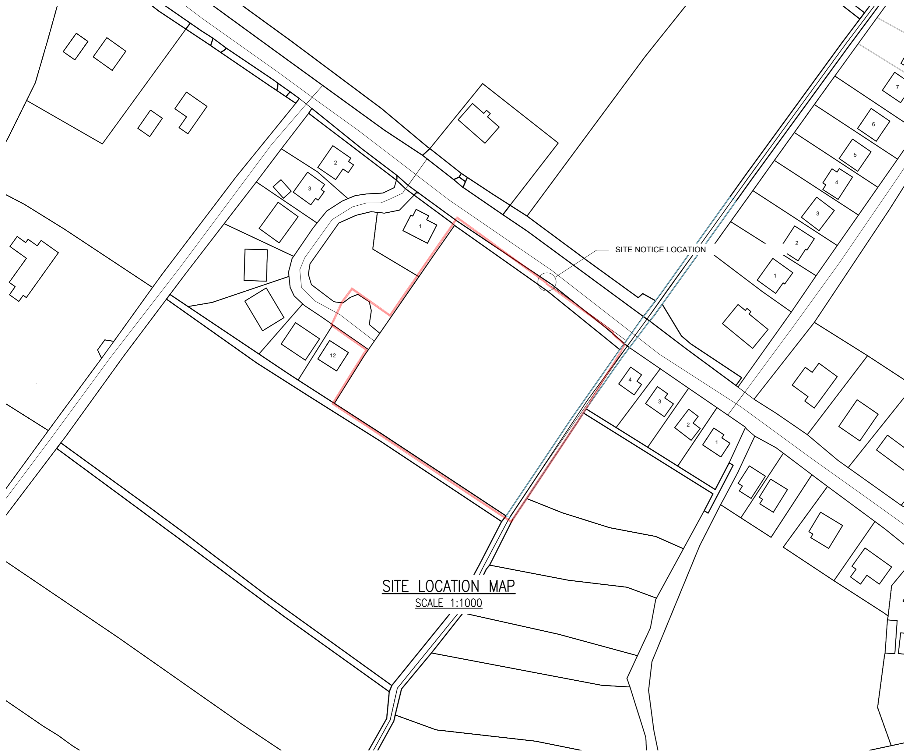
SITE LOCATION MAP SCALE 1:1000