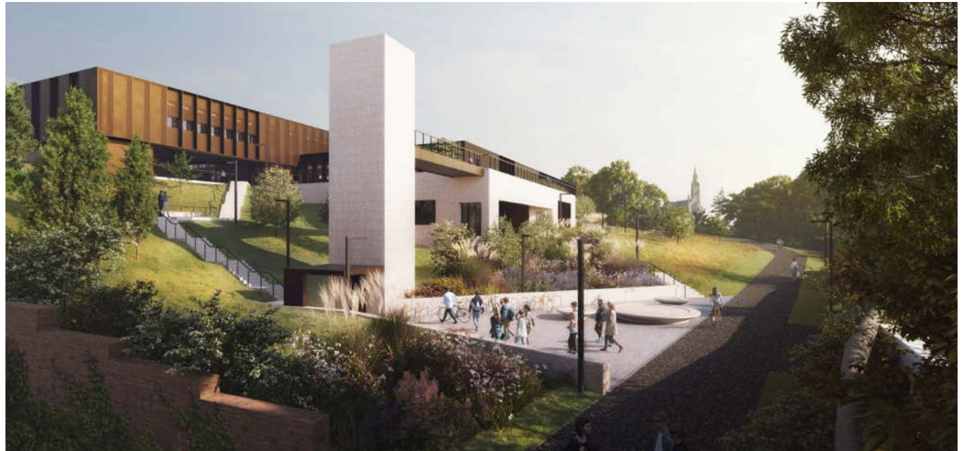
Short Stay Visitor Bicycle Parking Adjacent to St. Davent's Row

52 additional short-stay visitor bicycle spaces are provided at various points around the site within 25m of the entrances.