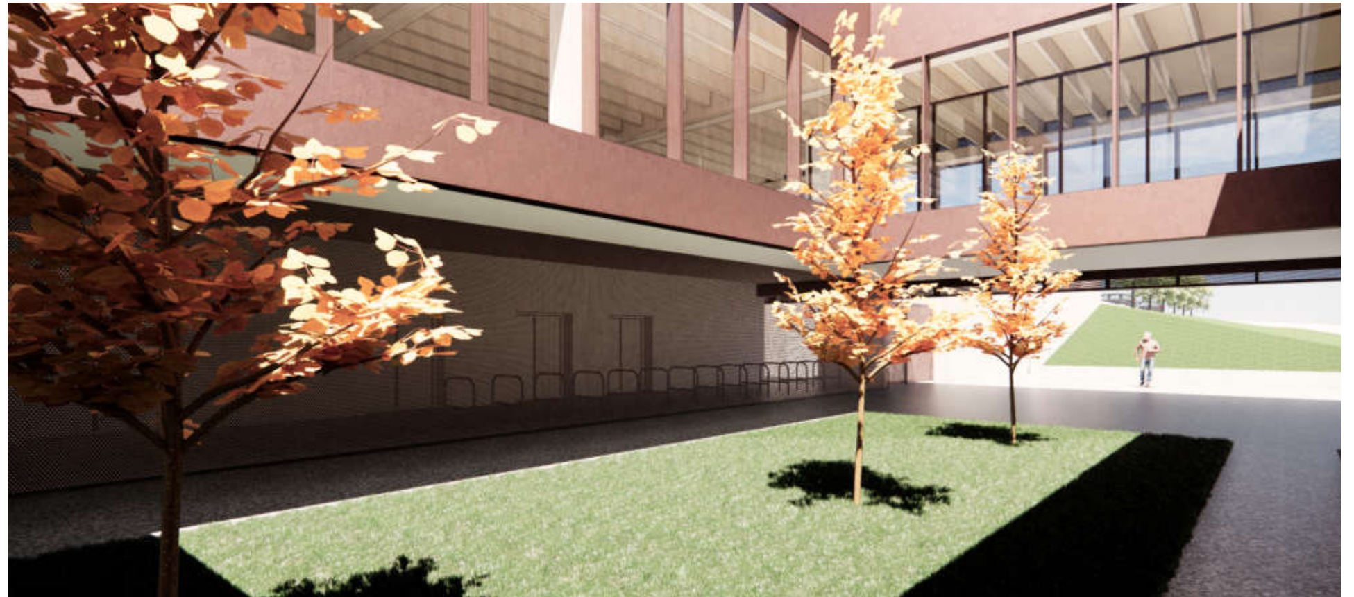
Perforated Metal Clad Bicycle Parking Spaces within the Entrance Courtyard to articulate the open space.