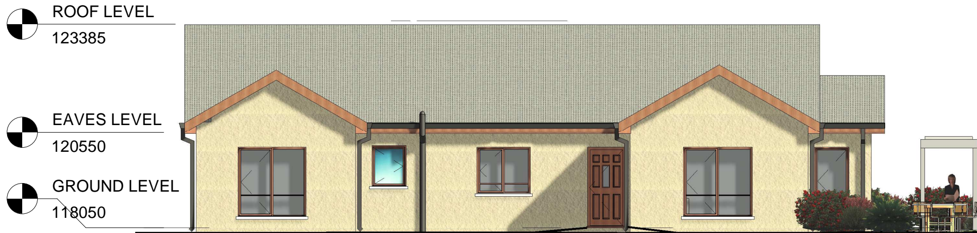
4 WEST ELEVATION 1 : 100