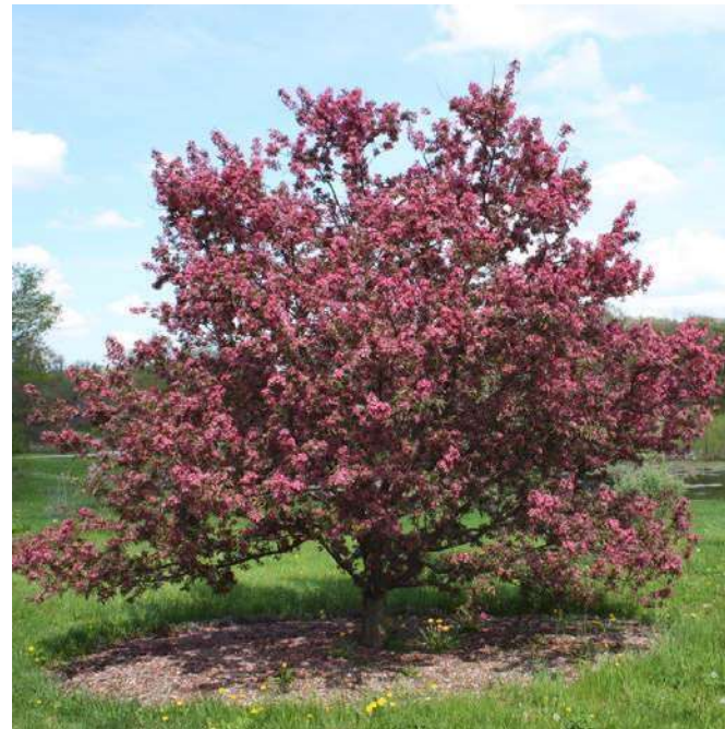
Small native deciduous tree Malus sylvestris (Crab Apple)