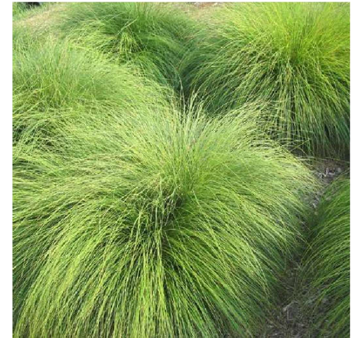
Textural plants Grasses, prickles, waxy leaves.....