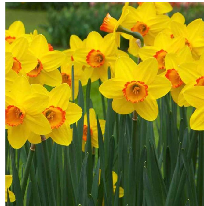
Colourful plants Daffodils, Bluebells, Rose of Sharon