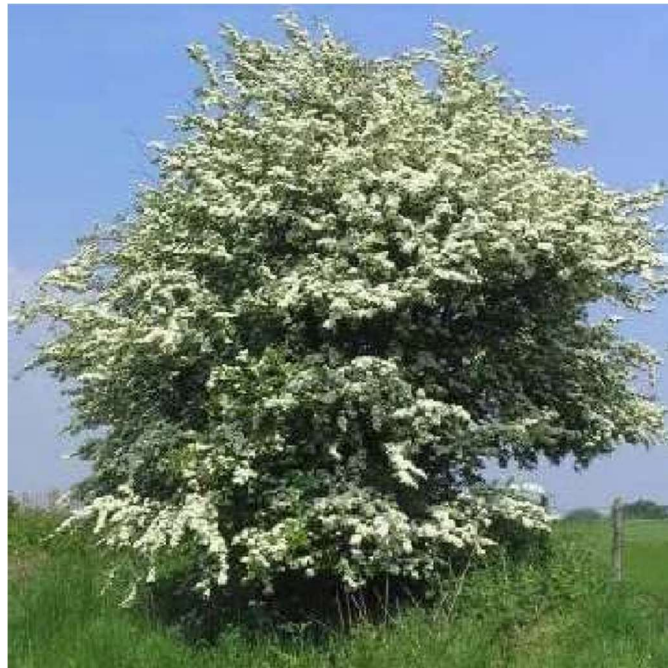
Small native deciduous tree Crataegus laevigata (Midland Hawthorn)