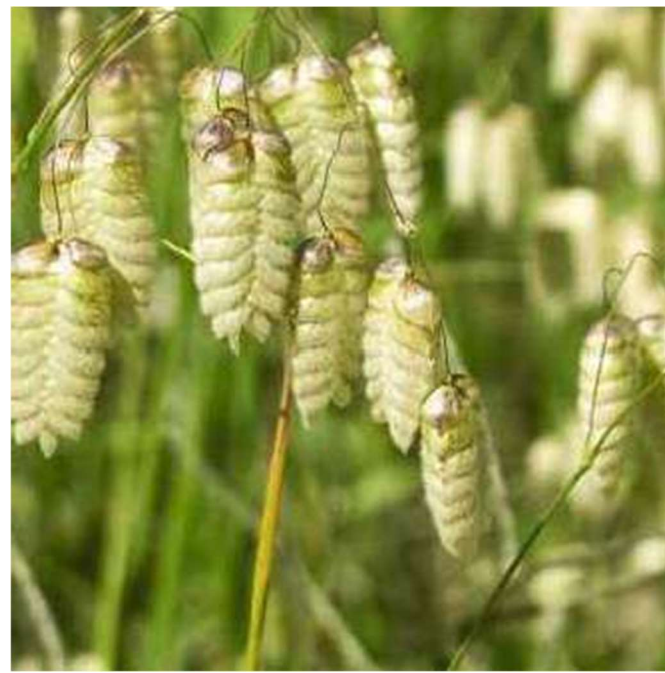
Noisy plants Quaking and popping seed pods, rustling leaves....