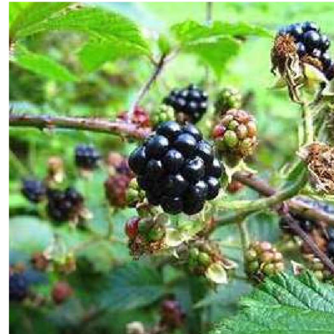
Edible plants Blackberry, Raspberry, Currants to the margins of the site / hedgerows