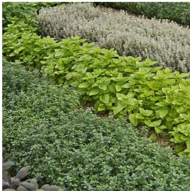
Scented plants Lavender, Rosemary, Thyme...