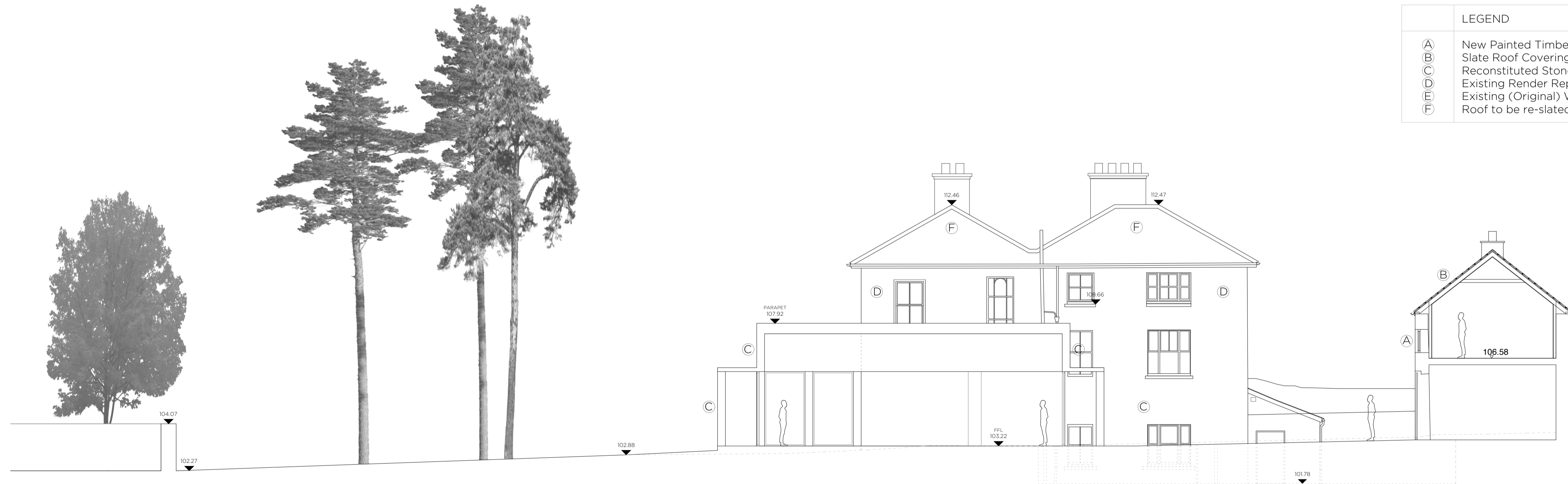
SECTION BB _ PROPOSED

113m 112m 111m 110m 109m 108m 107m 106m 105m 104m 103m 102m 101m