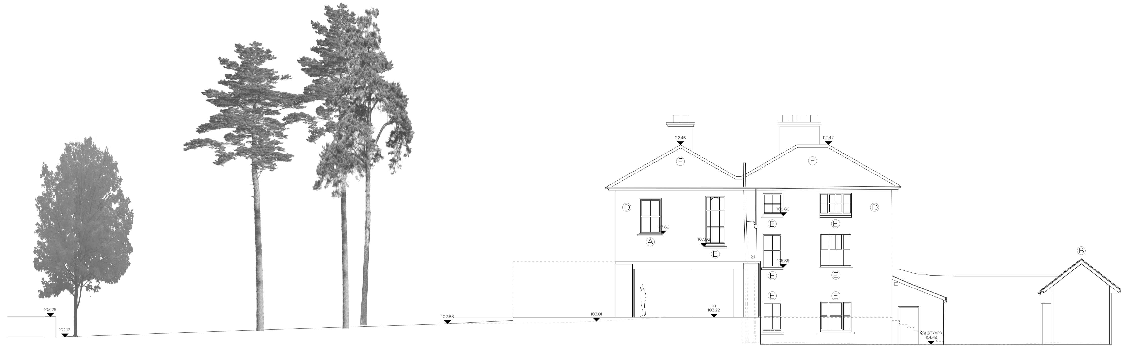
SECTION AA _ PROPOSED

113m 112m 111m 110m 109m 108m 107m 106m 105m 104m 103m 102m 101m