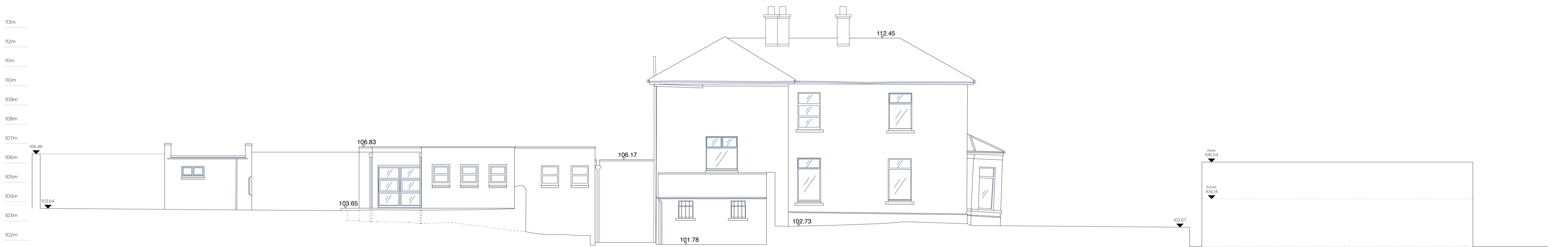
WEST ELEVATION _ EXISTING